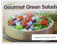
Tedeschi Tackles Nontraditional Foodservice