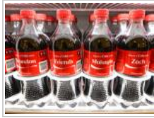
Coca-Cola Swaps Out Its Logo For 'Your Name Here'