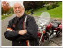
'The Soul of Nice N Easy'